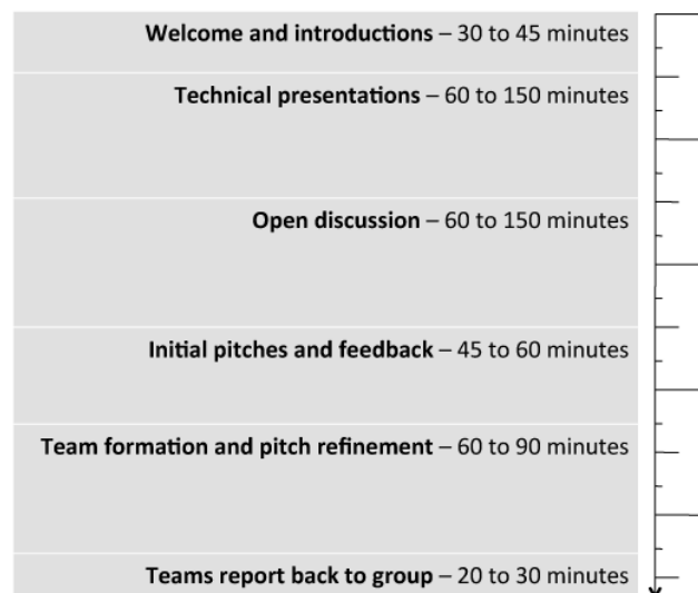
Figure 3. Typical schedule for day 1 of a hackathon.

The guidelines provided at https://nescent.github.io/community-and-code/doc/ outline the space requirements and room configuration for this team-development process. Some space configurations are inadvisable. A room with fixed stadium seating, for instance, is